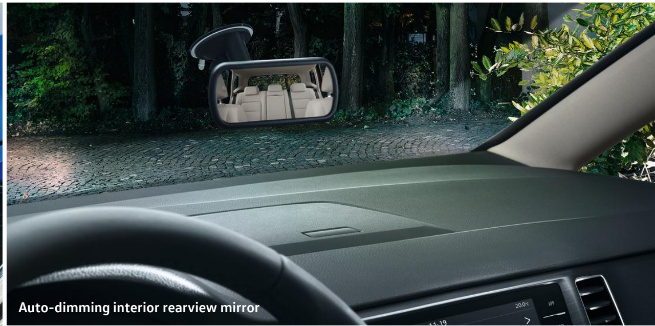
Auto-dimming interior rearview mirror