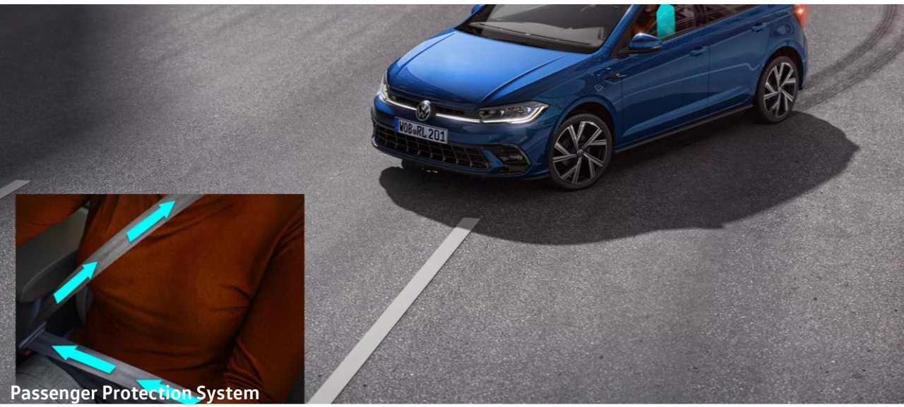
Passenger Protection System