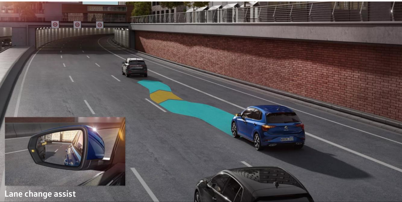
Lane change assist