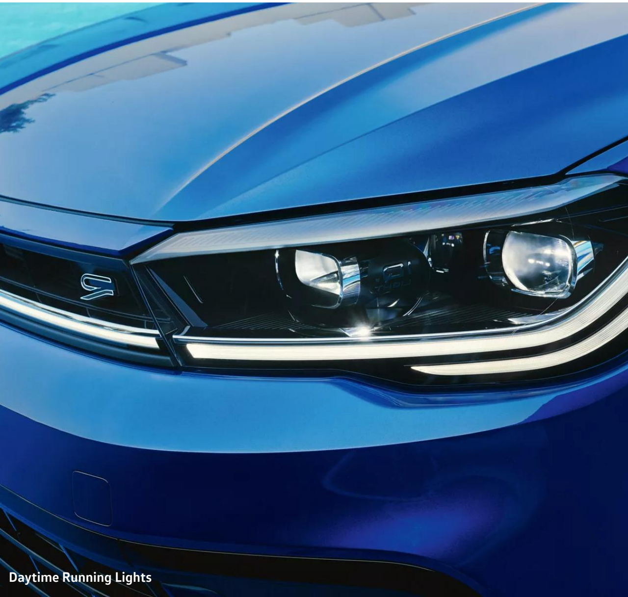
Daytime Running Lights